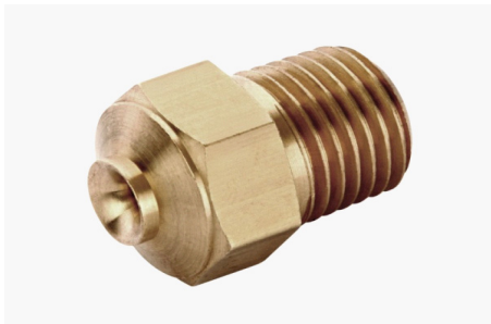
Type "S" nozzle Part # 147-00043