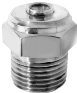
Type "S" nozzle Part # 147-00043