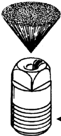
Type "PB" nozzle Part # 143-14132